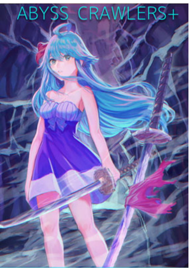
* Game *